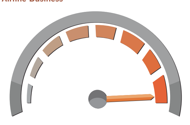
Trend 3: Analytics – An 'Altimeter' for the Airline Business

between the airlines and its passengers, thanks to the 'personal' touch it brings. For many service-related complaints and challenges, passengers still prefer to 'speak' with a customer service agent. In many instances, customers often drop off from making an online purchase of air tickets or travel packages because of technical errors, slow Website speed, or during the billing process using debit / credit cards. Such customers can be retained by the intelligent convergence of the online and offline channels, either by the smart placement of the customer service contact center number or by activating a click-to-call feature either on the airlines' Website or on the travel agencies' Websites. Where the online channel fails, the offline channel – the customer service contact center can take over smoothly to solve customer queries or problems.