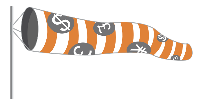
Trend 4: Changing the Course in Revenue Generation

Inadvertently rising fuel prices, dull economic conditions and increasing competition are realities that are biting into the revenue generating potential of the global airlines business today. Airline companies are thus exploring newer ways of changing the course in revenue generation. Some of these strategies include tapping alternate revenue generating streams such as selling ancillary products and services across the value chain or stopping revenue leakage via the total revenue integrity route.